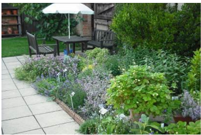
We are open 7 days a week including Bank Holidays. Monday to Saturday 9am-5pm (or until dusk in winter) Sunday 10am-4pm Closed from Christmas to 1st February