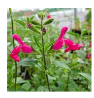
Salvia microphylla var. microphylla Blackcurrant Sage'

'Hot Lips' AGM Red and white bi-coloured flowers with scented foliage 35ins 'lcing Sugar' Shrubby perennial with spikes of vibrant pink flowers from mid-summer to autumn 32ins involucrata 'Bethellii' AGM Roseleaf sage. Native to central Mexico. Large leaves are purplish underneath. Long flower spikes of beetroot colour are surrounded by a whorl of bracts known as an involucre, hence the name. This variety has a distinctive pink 'bobble' flower bud on the top of the spike which does not open. Fertile well drained soil in sun. Hardy to -4c if mulched. 5ft