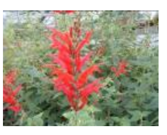
Salvia elegans 'Scarlet Pineapple'

leucantha 'Purple Velvet' Leaves downy white underneath. Velvety, deep purple flowers from August to November. Sunny site in well drained soil. Protect from frost 3ft microphylla 'Pink Blush' Pale pink flowers from mid-summer to autumn 2ft