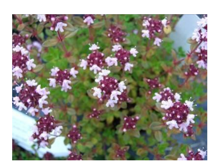
Thyme 'Pink Ripple'