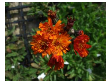
Fox and Cubs