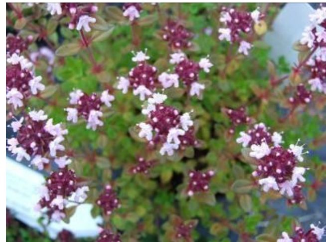
Thyme 'Pink Ripple'