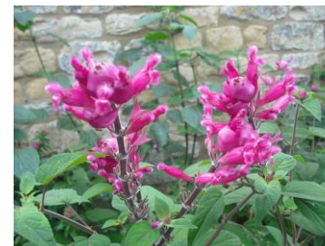
Salvia involucrata 'Bethellii'