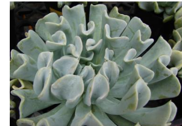
Echeveria 'Topsy Turvy'

AEONIUM Simsii x 'Zwartkop' Tender succulent which forms rosettes of deep blackish-purple leaves, and bright yellow, starry flowers' in early spring. " haworthia 'Variegata' Succulent rosettes edged with cream and a pink blush in summer ALOE vera AGM Lance-shaped grey-green leaves with toothed margins, scarlet flowers BULBINE frutescens African Bulbine Succulent foliage with star-shaped orange flowers ECHEVERIA affinis Narrow, shiny, dark chocolate-brown succulent rosettes with red flowers " 'Black Knight' New hybrid with compact rosettes of dark green to black. Deep reddish-orange flowers in summer Foliage to 6in " peacockii Blue-green rosettes and pendant cup-shaped red and yellow flowers in spring " 'Perle von Numberg' AGM Large pink and grey rosettes. Orange-lemon flowers " rosea AGM Greenish-silver succulent leaves that blush red in summer. Red and yellow flowers " runyonii 'Topsy Turvy' AGM Large blue-grey rosettes that curve upwards. Salmon-pink flowers on long stems X GRAPTOVERIA 'Titubans' Porcelain Plant . Blue-green rosettes on creeping stems and yellow flowers. SENECIO kleiniiformis Spear Head Succulent from S. Africa. Blue-green triangular, spear-shaped leaves. pale yellow flowers in late summer. Attractive to butterflies.