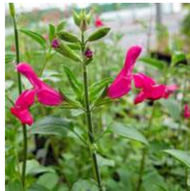
Salvia microphylla var. microphylla Blackcurrant Sage'