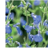
Salvia 'African Sky'