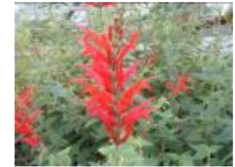
Salvia elegans 'Scarlet Pineapple'